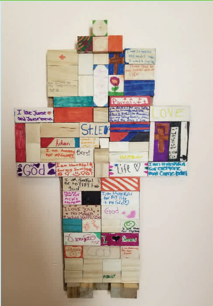
Unity in our diversity and the spirit of family are displayed in this cross made of wooden blocks with messages of love and gratitude written on them by members of St. Leo's youth group during their first retreat together. We are one in Christ.